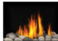
River Rocks available in Grey or Multi-colored