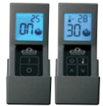
Convenient Remote Control