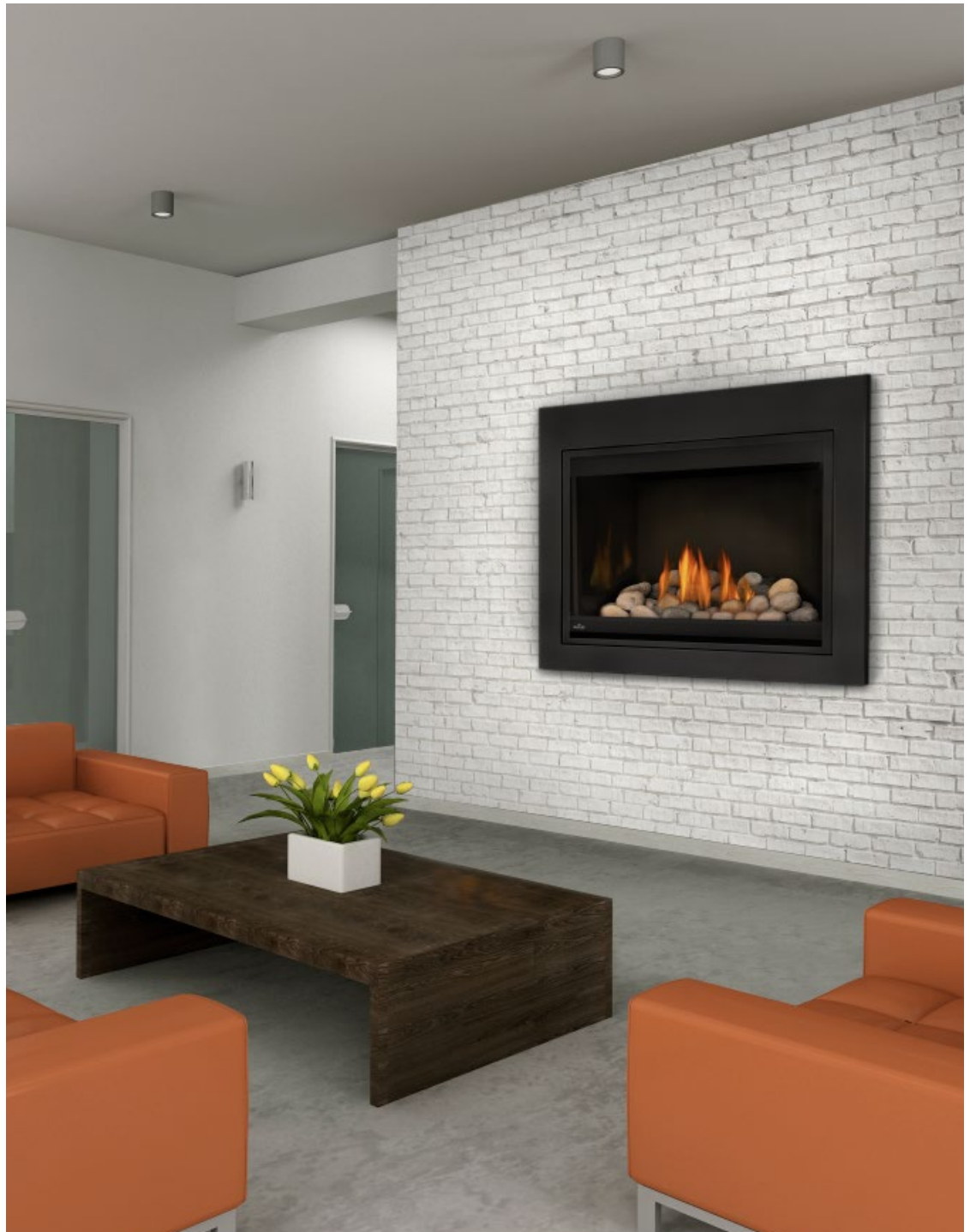
Grandville™ 36 CF shown with standard clean face front, multi-color River Rock media kit and MIRRO-FLAME™ Porcelain Reflective Radiant Panels.