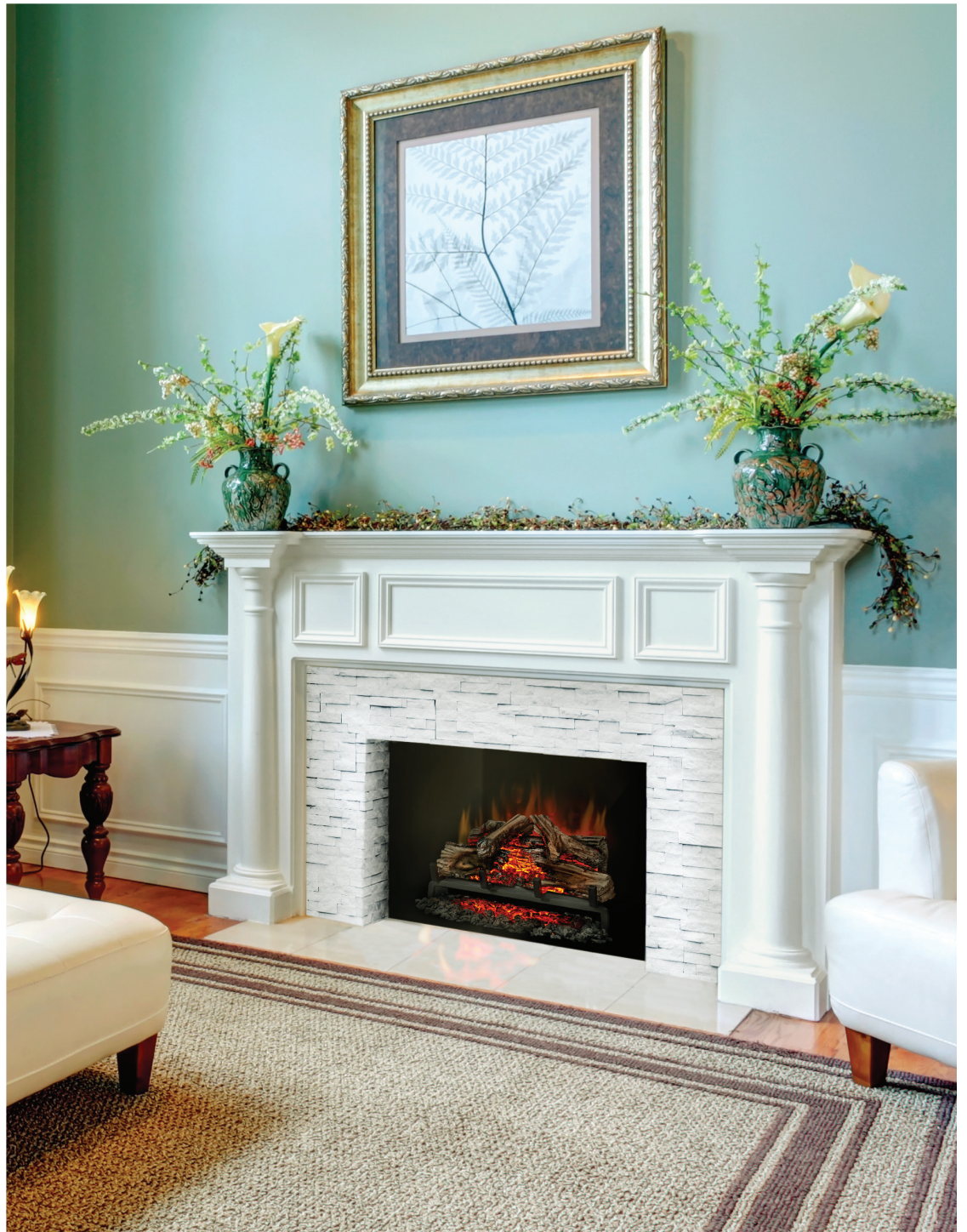
Woodland 24" electric log set.