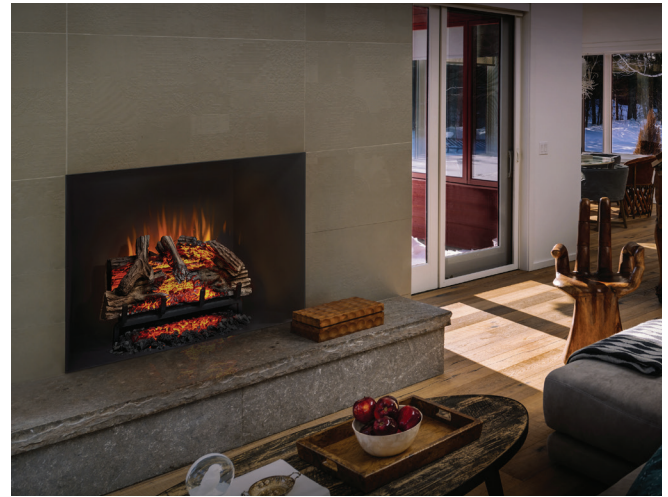
Woodland™ 27 electric log set