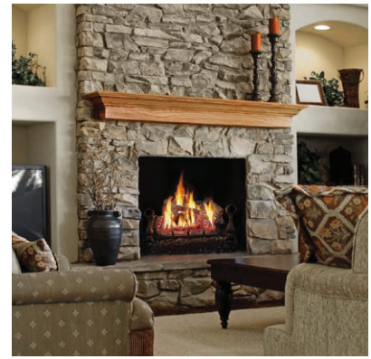
Right and Cover: GL24E gas log set shown with lava rocks/cinders

*Allow 4-6" additional height for optimum flame appearance.