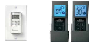
Programmable Timer & Remote Controls