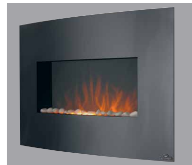
Right and Cover: EFC32 with standard stone ember bed

Line dimensions and measurements are to be used as a guide only. Please consult your installation manual for updated and precise measurements before proceeding to install or frame your Napoleon® Fireplace. Tested in Canada and the U.S. to CSA C22.2 46/ UL1278.