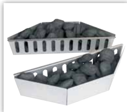
67400 - Charcoal Baskets