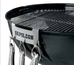
55100 - Toolset hanger