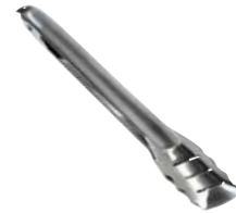
55013 - Tongs