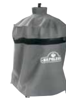
63910 - Charcoal Cover