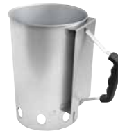
67800 - Charcoal Starter