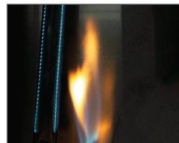
JETFIRE™ Ignition System