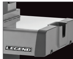
Integrated Beverage Holders