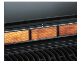
Rear Infrared Rotisserie Burner