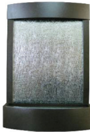
WF4SMZ-RG: 37"H x 25"W x 8"D Pump: 320 Gal / h