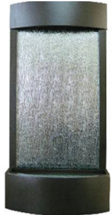
WF10SMZ-RG: 60"H x 25"W x 8"D Pump: 1900 Gal / h