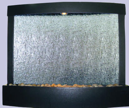
WF5SMK-RG: 30"H x 36"W x 7 1/2"D Pump: 320 Gal / h