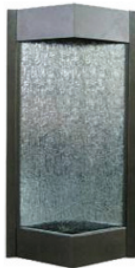
WF3SMZ-RG: 36"H x 19"W x 6"D Pump: 320 Gal / h