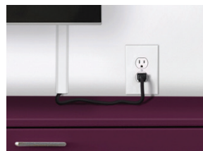
Paintable Cord Cover