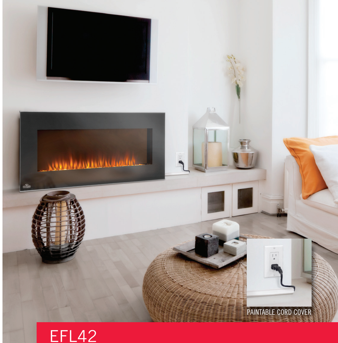
PAINTABLE CORD COVER