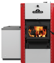
Wood only furnace