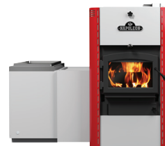
Wood/ Electric furnace