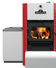
Wood/ Oil furnace