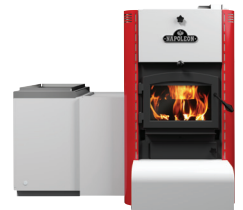
Wood/ Oil/ Electric